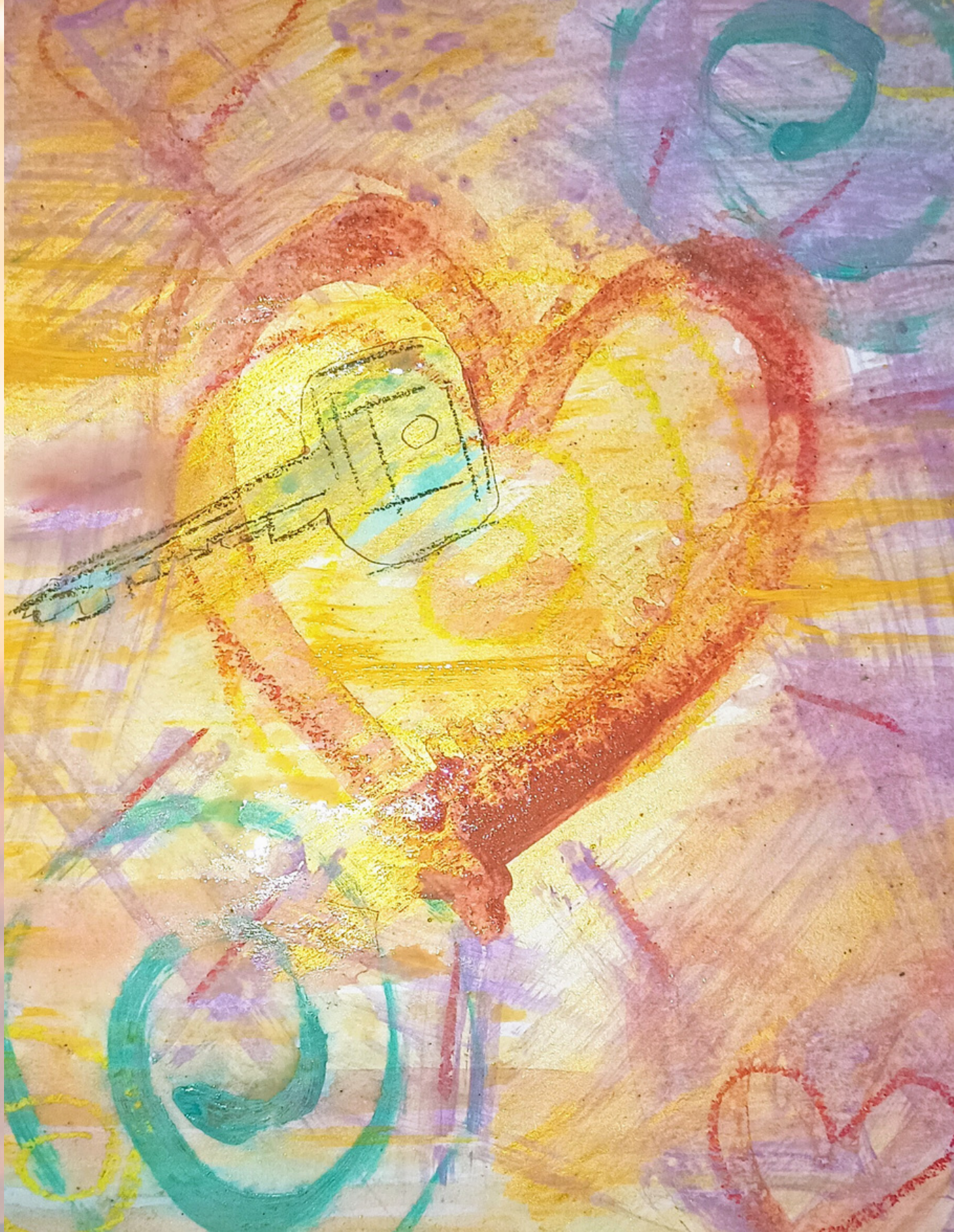
Clé et Cœur Mixed Media on Watercolour Paper 9"X12" Lenny Hope