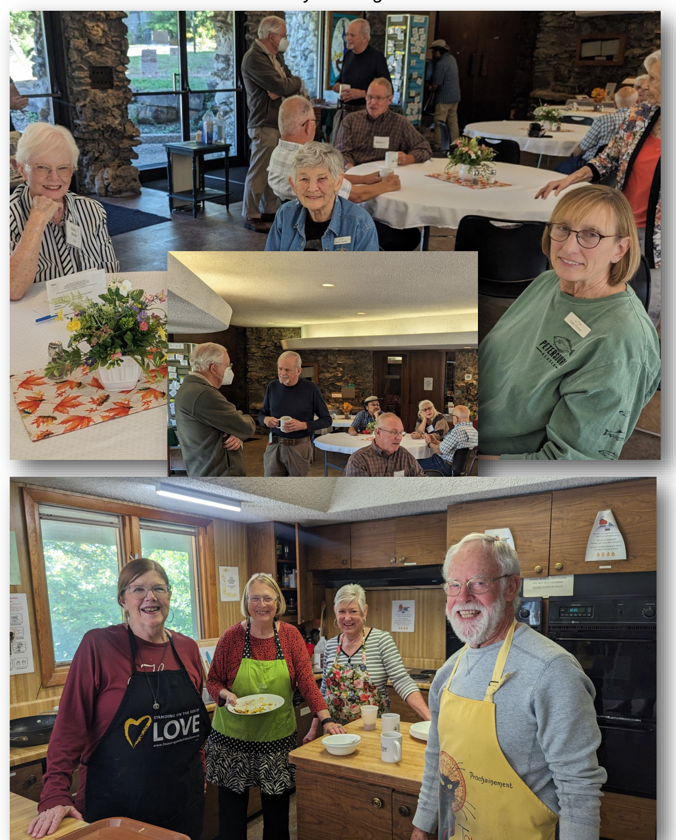
Breakfast on the Hill on October 8th, 2023