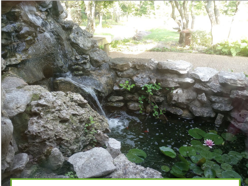
The goldfish know the best place to be on a hot day!